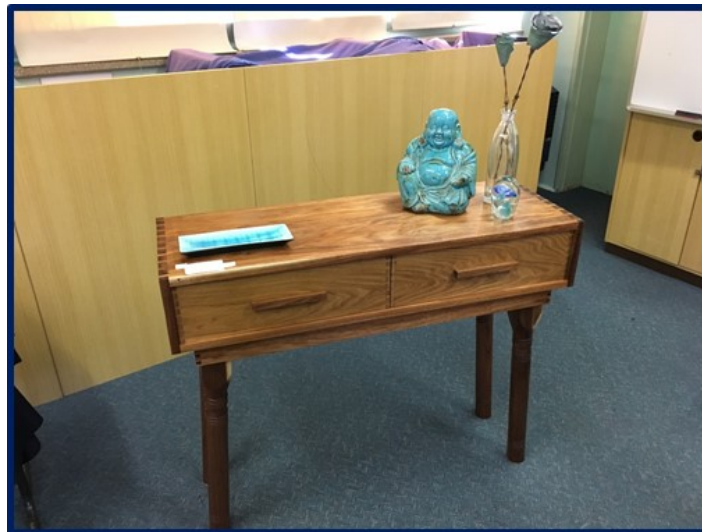
Ryan Miller—Hall Table