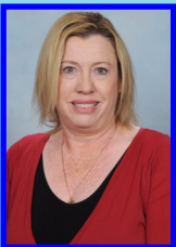
(Year 8, 10 & 12)

TELEPHONE: 68452344 or 68452279 FAX: 68451380 PO BOX 21 WELLINGTON 2820